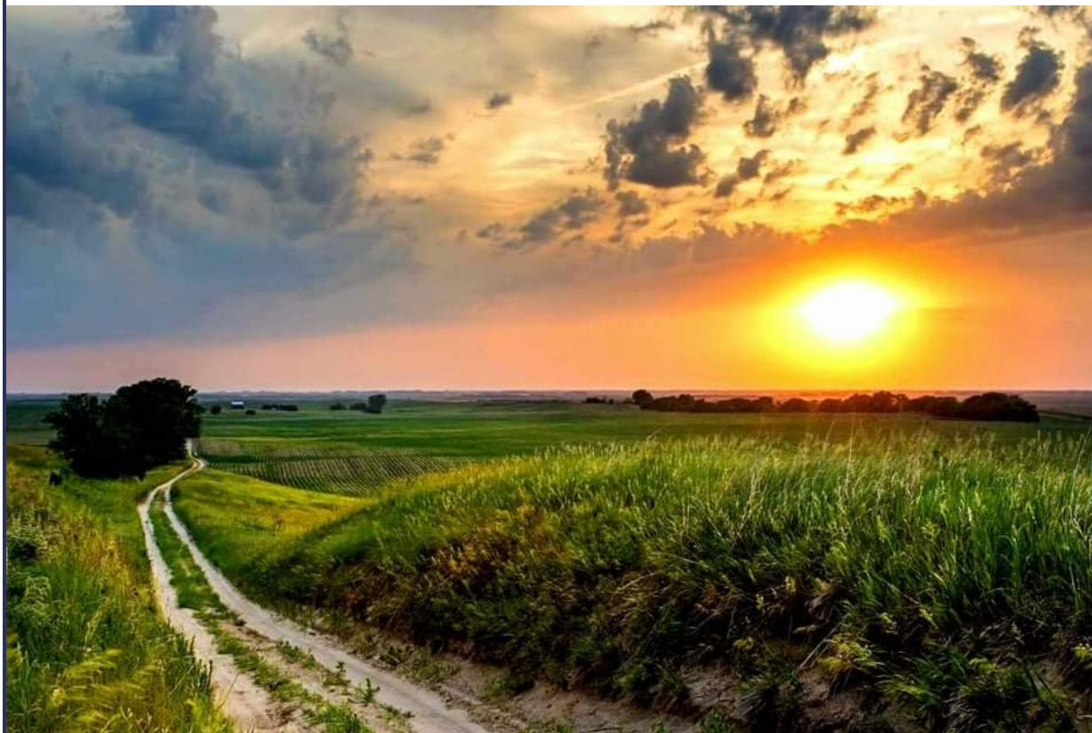
Cheyenne County