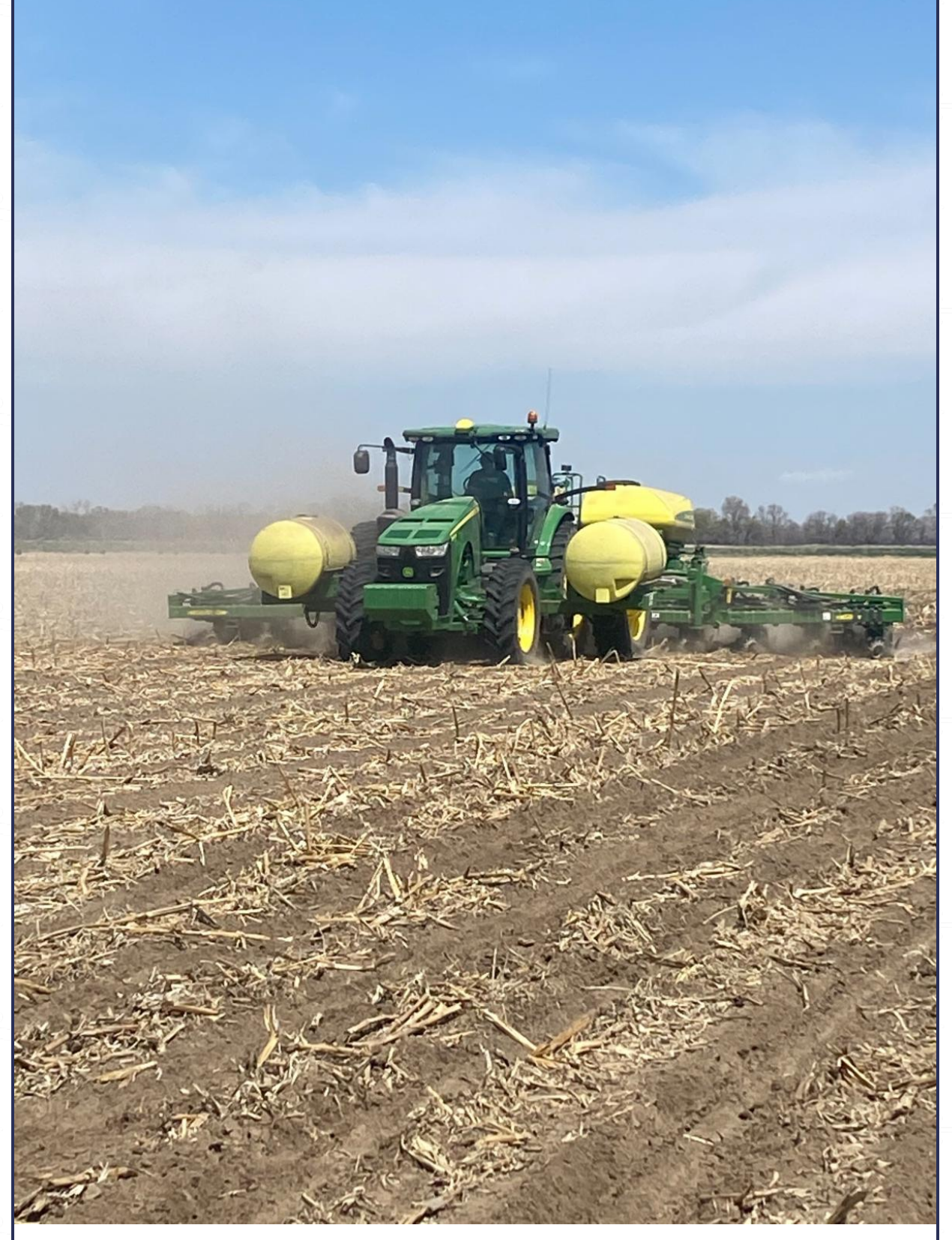
Dawson County, submitted by Rod Reynolds